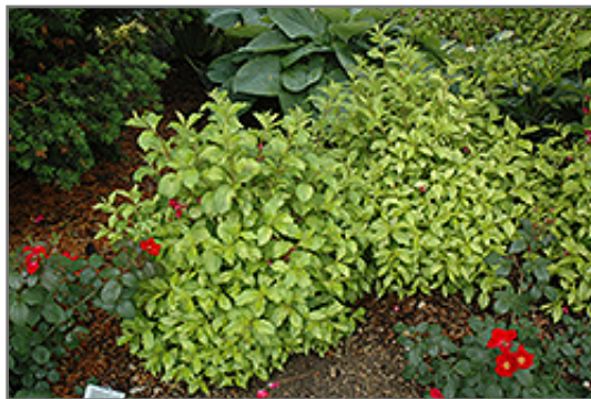
Ghost Weigela

* This is a 'special order' plant - contact store for details