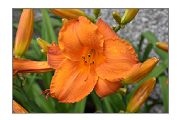
Mauna Loa Daylily flowers