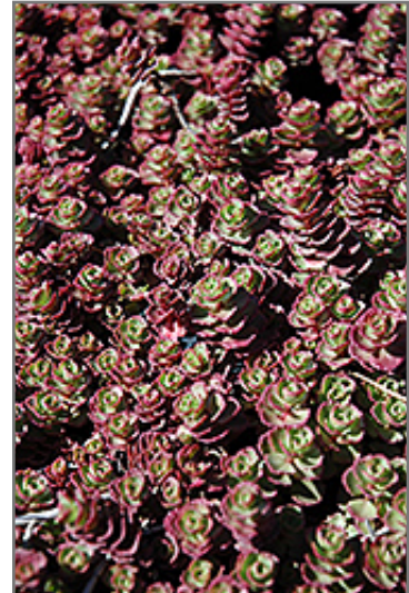
Red Carpet Stonecrop foliage

Red Carpet Stonecrop is a dense herbaceous perennial with a ground-hugging habit of growth. It brings an extremely fine and delicate texture to the garden composition and should be used to full effect.