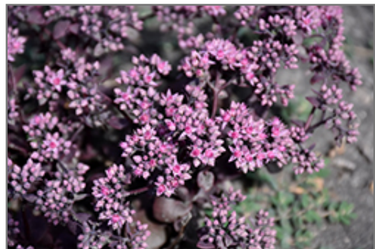
Red Carpet Stonecrop flowers