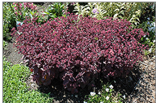
Xenox Stonecrop in bloom