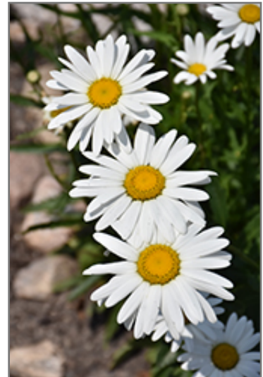
Silver Princess Shasta Daisy flowers