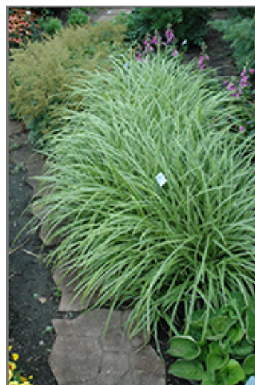
Ice Dance Sedge