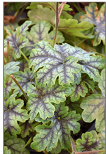
Tapestry Foamy Bells foliage