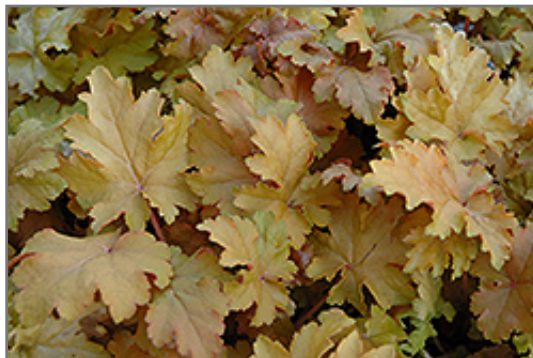
Amber Waves Coral Bells foliage