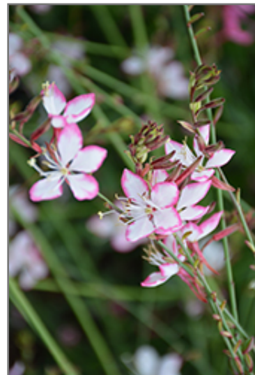
Rosy Jane Gaura flowers

Rosy Jane Gaura is recommended for the following landscape applications;