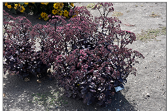
Cherry Truffle Stonecrop in bloom