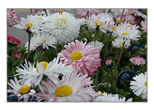
Super Enorma English Daisy flowers

Super Enorma English Daisy is recommended for the following landscape applications;