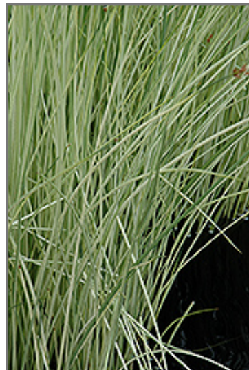
White Rush foliage