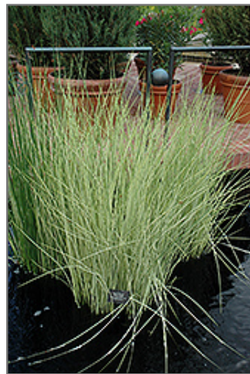
White Rush flowers