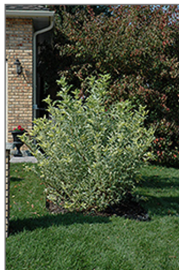
Madonna Elder