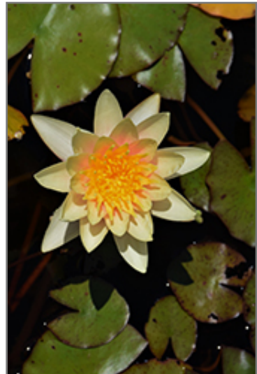
Comanche Hardy Water Lily flowers

Comanche Hardy Water Lily is ideally suited for growing in a pond, water garden or patio water container, and is recommended for the following landscape applications;