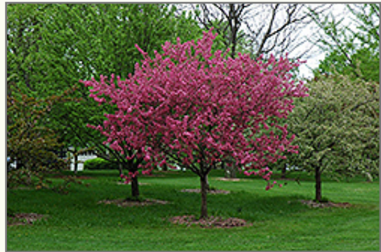
Prairiefire Flowering Crabapple in bloom

Prairiefire Flowering Crabapple is a deciduous tree with an upright spreading habit of growth. Its average texture blends into the landscape, but can be balanced by one or two finer or coarser trees or shrubs for an effective composition.