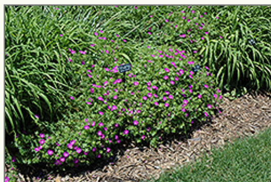
New Hampshire Purple Geranium in bloom