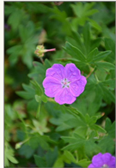
New Hampshire Purple Geranium flowers

New Hampshire Purple Geranium is a fine choice for the garden, but it is also a good selection for planting in outdoor pots and containers. It is often used as a 'filler' in the 'spiller-thriller-filler' container combination, providing a mass of flowers against which the thriller plants stand out. Note that when growing plants in outdoor containers and baskets, they may require more frequent waterings than they would in the yard or garden. Be aware that in our climate, most plants cannot be expected to survive the winter if left in containers outdoors, and this plant is no exception. Contact our experts for more information on how to protect it over the winter months.