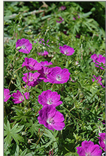
New Hampshire Purple Geranium flowers

New Hampshire Purple Geranium is a dense herbaceous perennial with a mounded form. It brings an extremely fine and delicate texture to the garden composition and should be used to full effect.