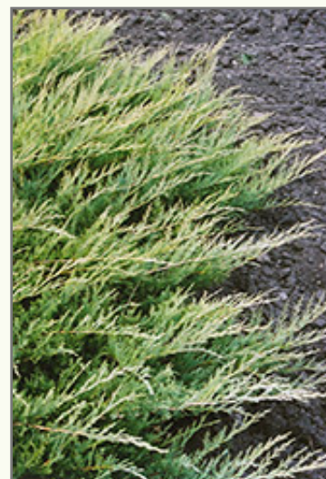
Broadmoor Juniper foliage