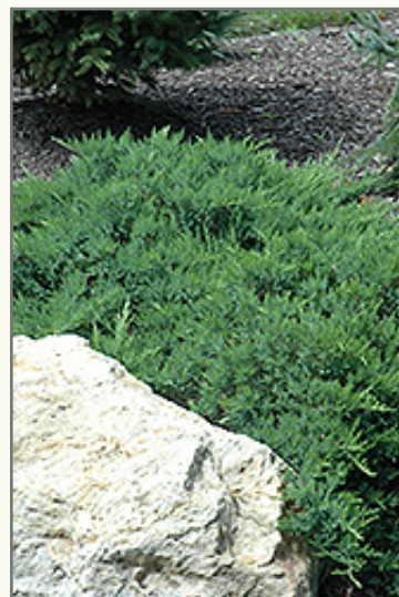
Broadmoor Juniper