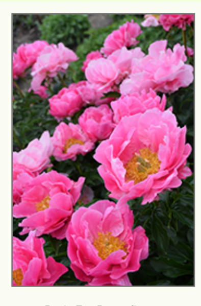
Paula Fay Peony flowers