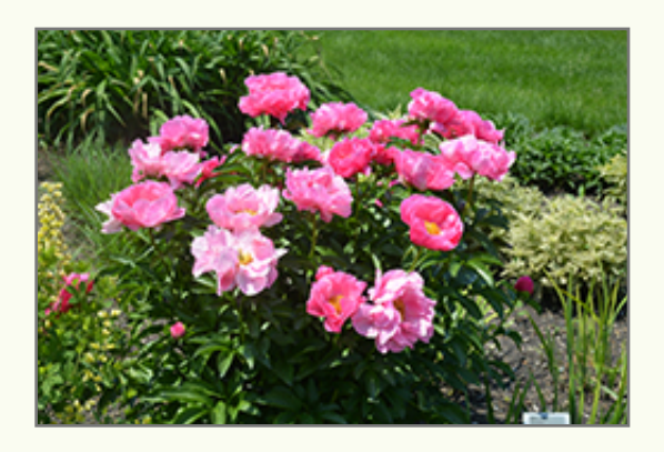
Paula Fay Peony in bloom