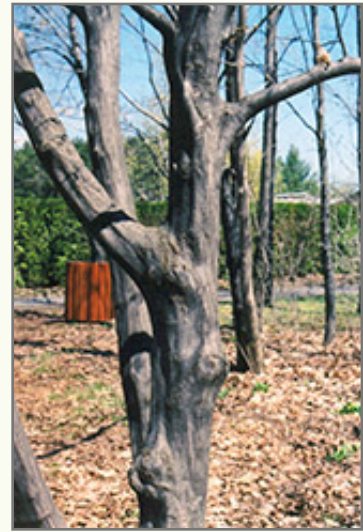
Blue Beech bark