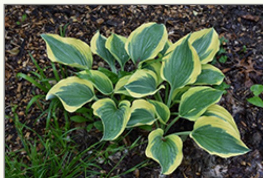
Liberty Hosta