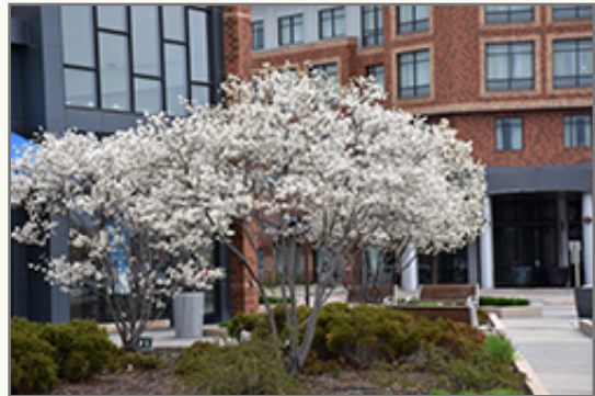
Autumn Brilliance® Serviceberry in bloom

This tree will require occasional maintenance and upkeep, and is best pruned in late winter once the threat of extreme cold has passed. It is a good choice for attracting birds to your yard, but is not particularly attractive to deer who tend to leave it alone in favor of tastier treats. It has no significant negative characteristics.