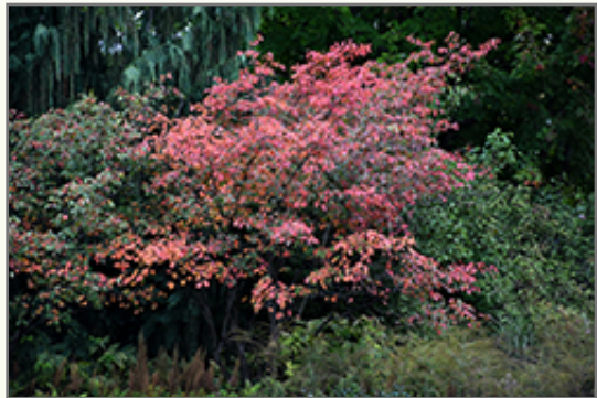
Autumn Brilliance® Serviceberry in fall