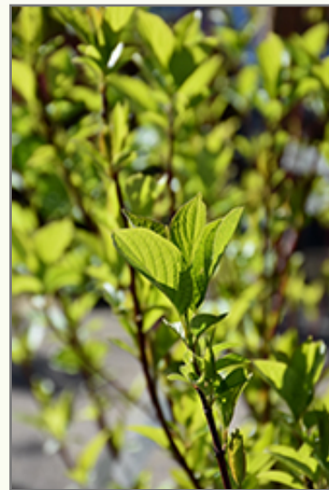
Red Twigged Dogwood foliage