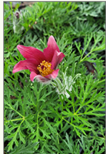
Red Pasque Flower flowers