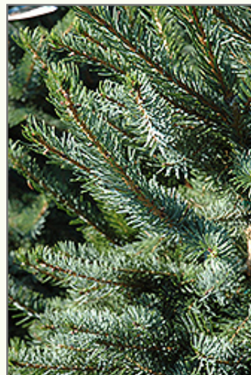
Bruns Serbian Spruce foliage