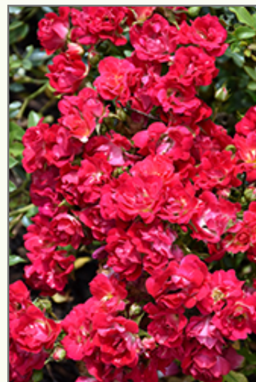
Red Drift® Shrub Rose flowers