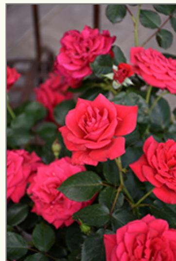
Easy Elegance® Super Hero Shrub Rose flowers