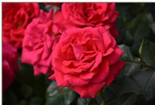
Easy Elegance® Super Hero Shrub Rose flowers