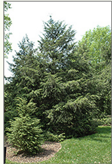
Canadian Hemlock