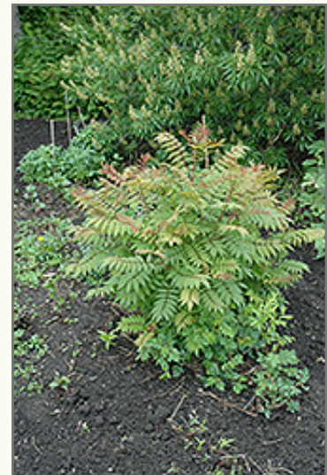
Sem Ash Leaf Spirea