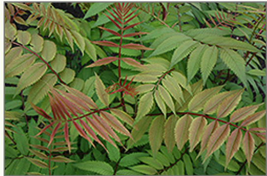
Sem Ash Leaf Spirea foliage

Sem Ash Leaf Spirea is a multi-stemmed deciduous shrub with a more or less rounded form. Its average texture blends into the landscape, but can be balanced by one or two finer or coarser trees or shrubs for an effective composition.