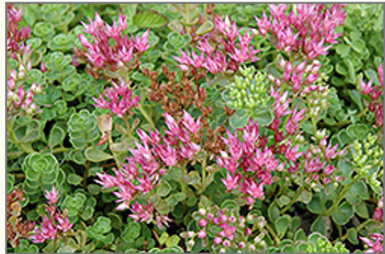
John Creech Sedum flowers

This plant will require occasional maintenance and upkeep, and is best cleaned up in early spring before it resumes active growth for the season. Deer don't particularly care for this plant and will usually leave it alone in favor of tastier treats. Gardeners should be aware of the following characteristic(s) that may warrant special consideration;