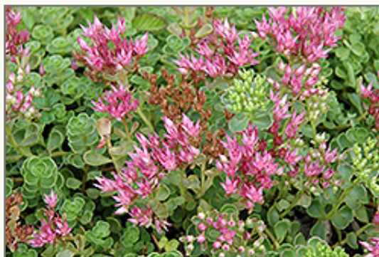
John Creech Sedum flowers

This plant will require occasional maintenance and upkeep, and is best cleaned up in early spring before it resumes active growth for the season. Deer don't particularly care for this plant and will usually leave it alone in favor of tastier treats. Gardeners should be aware of the following characteristic(s) that may warrant special consideration;