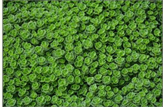
John Creech Sedum foliage