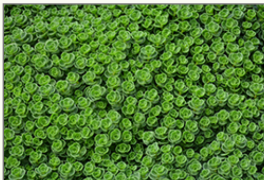
John Creech Sedum foliage