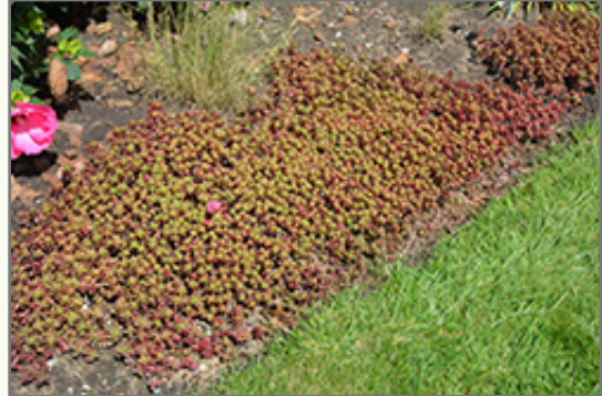
Fireglow Sedum