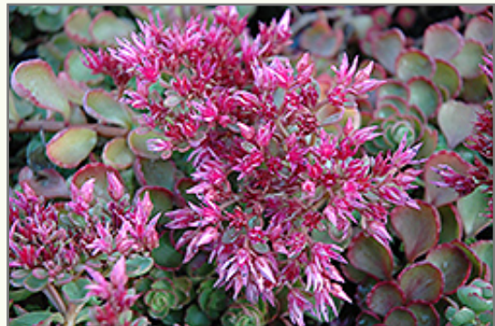
Fireglow Sedum flowers