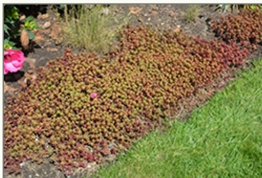
Fireglow Sedum