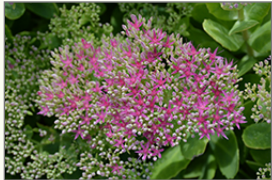
Neon Sedum flower buds