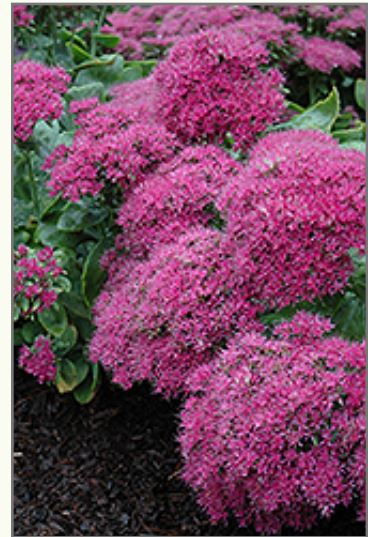
Neon Sedum flowers

Neon Sedum is a dense herbaceous perennial with an upright spreading habit of growth. Its relatively coarse texture can be used to stand it apart from other garden plants with finer foliage.