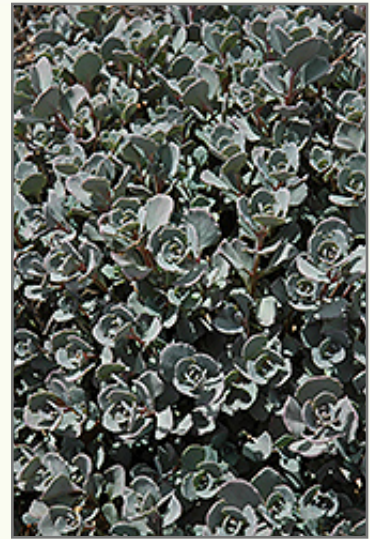
Lidakense Sedum foliage

Lidakense Sedum is recommended for the following landscape applications;