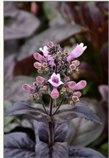
Dakota Burgundy Beard Tongue flowers

Dakota Burgundy Beard Tongue has masses of beautiful spikes of shell pink tubular flowers with lavender overtones, white throats and lavender streaks rising above the foliage from early to mid summer, which are most effective when planted in groupings. The flowers are excellent for cutting. Its attractive serrated pointy leaves emerge brick red in spring, turning burgundy in color with showy dark green variegation and tinges of crimson. As an added bonus, the foliage turns a gorgeous dark red in the fall. The dark red fruits with black overtones are held in abundance in spectacular clusters from late summer to early winter. The dark red stems are very colorful and add to the overall interest of the plant.