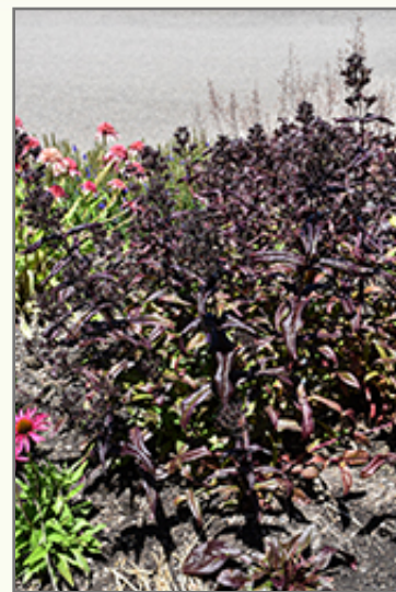
Dakota Burgundy Beard Tongue

Dakota Burgundy Beard Tongue is a fine choice for the garden, but it is also a good selection for planting in outdoor pots and containers. With its upright habit of growth, it is best suited for use as a 'thriller' in the 'spiller-thriller-filler' container combination; plant it near the center of the pot, surrounded by smaller plants and those that spill over the edges. Note that when growing plants in outdoor containers and baskets, they may require more frequent waterings than they would in the yard or garden. Be aware that in our climate, most plants cannot be expected to survive the winter if left in containers outdoors, and this plant is no exception. Contact our experts for more information on how to protect it over the winter months.