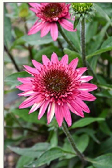
Giddy Pink Coneflower flowers

This is a relatively low maintenance plant, and is best cleaned up in early spring before it resumes active growth for the season. It is a good choice for attracting bees and butterflies to your yard, but is not particularly attractive to deer who tend to leave it alone in favor of tastier treats. It has no significant negative characteristics.