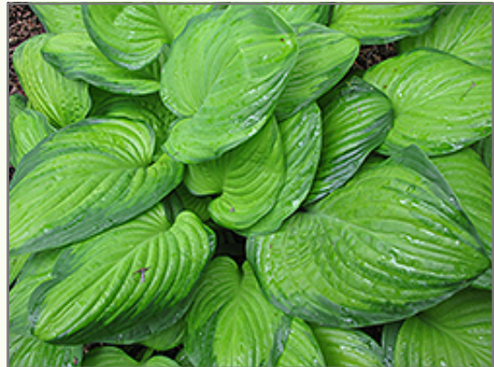
Guacamole Hosta foliage