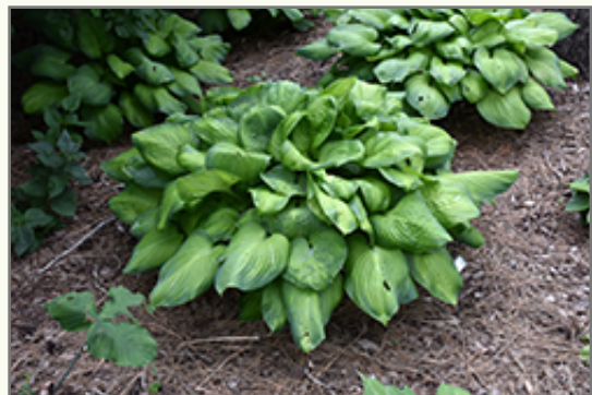
Guacamole Hosta