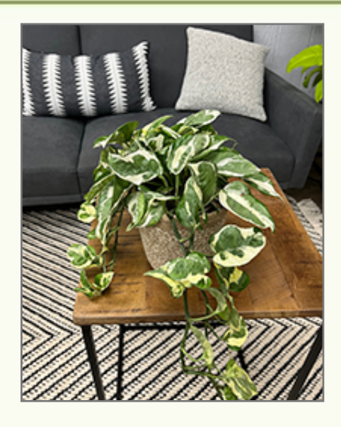
Beautifall N'Joy Pothos in full

Beautifall N'Joy Pothos' attractive heart-shaped leaves remain forest green in color with showy creamy white variegation and tinges of buttery yellow throughout the year on a plant with a spreading habit of growth.