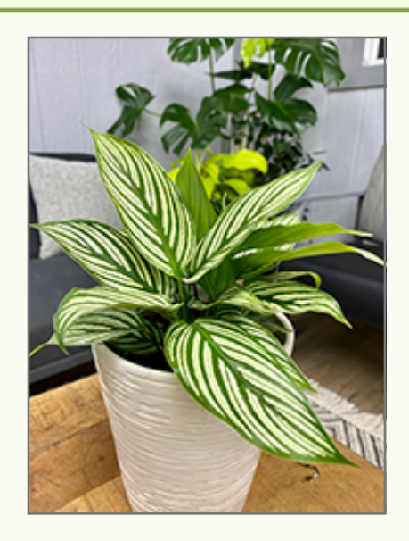
Color Full Vittata Prayer Plant in full

This is an herbaceous evergreen houseplant with an upright spreading habit of growth. Its relatively coarse texture stands it apart from other indoor plants with finer foliage. This plant should not require much pruning, except when necessary to keep it looking its best.