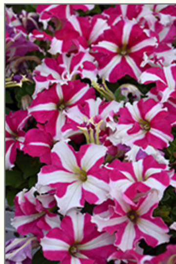
TriTunia Rose Star Petunia flowers

TriTunia Rose Star Petunia is recommended for the following landscape applications;