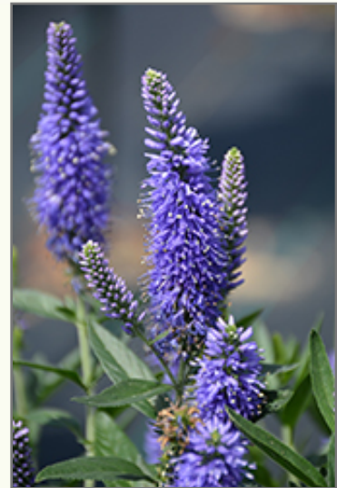
Skyward Blue Long-leaf Speedwell flowers