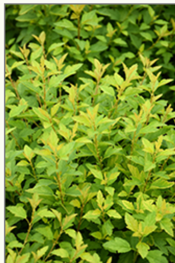
Raspberry Lemonade Ninebark foliage

This shrub will require occasional maintenance and upkeep, and can be pruned at anytime. It has no significant negative characteristics.