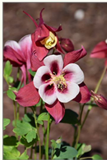
Earlybird Red and White Columbine flowers

Earlybird Red and White Columbine is recommended for the following landscape applications;