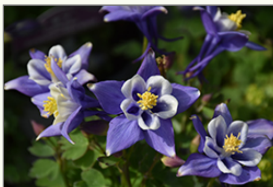
Earlybird Blue and White Columbine flowers