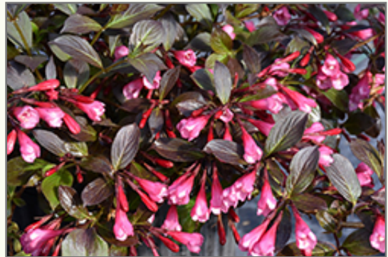
Very Fine Wine Weigela flowers

Very Fine Wine Weigela is recommended for the following landscape applications;