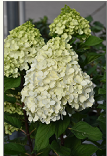
Little Lime Punch Hydrangea flowers

Little Lime Punch Hydrangea is recommended for the following landscape applications;