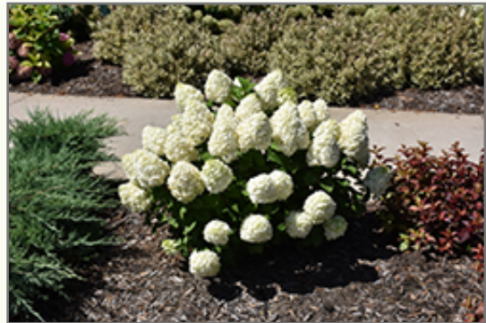
Little Lime Punch Hydrangea in bloom