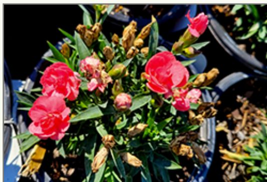
Constant Cadence Salmon Pinks flowers

Constant Cadence Salmon Pinks is recommended for the following landscape applications;