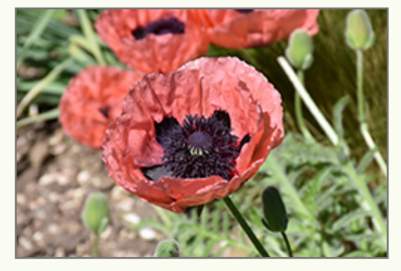
Princess Louise Poppy flowers

This plant will require occasional maintenance and upkeep, and should only be pruned after flowering to avoid removing any of the current season's flowers. Deer don't particularly care for this plant and will usually leave it alone in favor of tastier treats. Gardeners should be aware of the following characteristic(s) that may warrant special consideration;