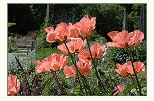
Princess Louise Poppy flowers