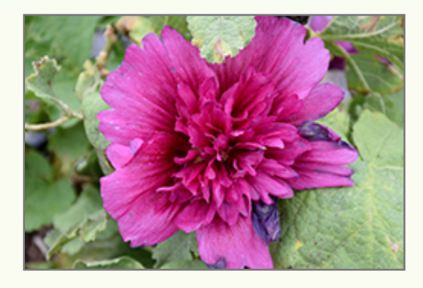
Spring Celebrities Purple Hollyhock flowers