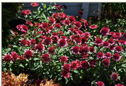
Sunny Days Ruby Coneflower in bloom