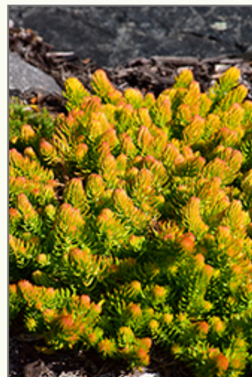
Angelina Sedum foliage