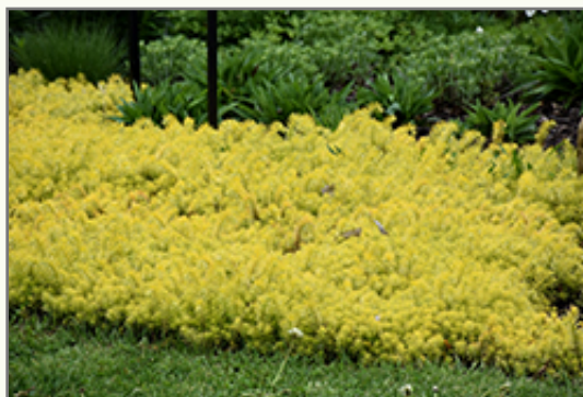
Angelina Sedum