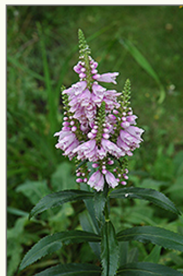
Obedient Plant flowers

Obedient Plant is an herbaceous perennial with an upright spreading habit of growth. Its medium texture blends into the garden, but can always be balanced by a couple of finer or coarser plants for an effective composition.